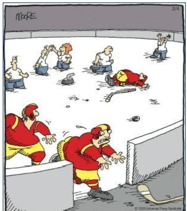
The fight ends, the hockey players flee, and the curling team once again rules the ice rink.